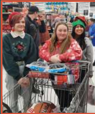
Christmas Shopping for Sparky Claus